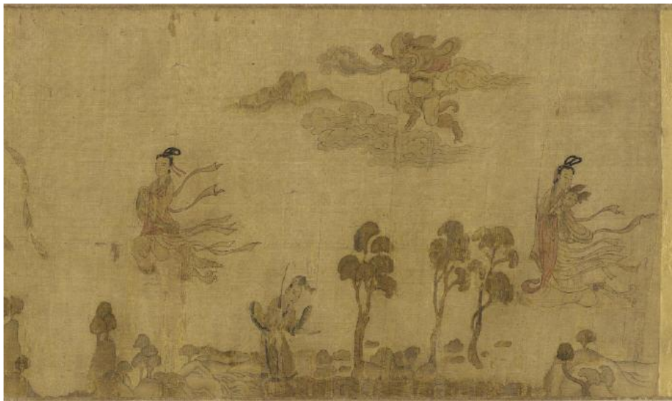
(Left): An image of Section 1 of the Nymph of the Luo River , a painting described in Li's work from Duanfang's collection. The mid-12 th to mid-13 th century handscroll, which is ink and color on silk, presently resides at the Freer Gallery.