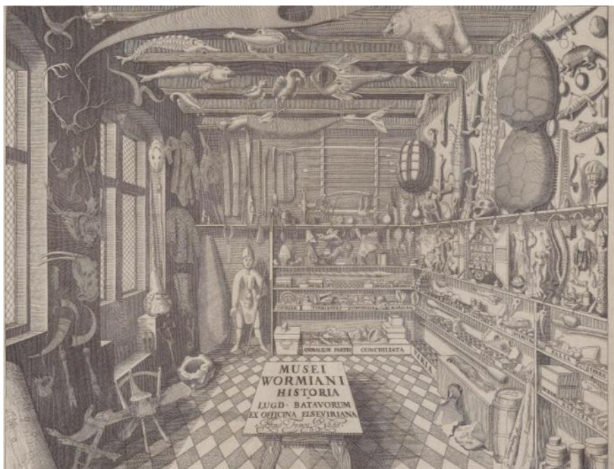
(Above); Museum Wormianum; seu, Historia rerum rariorum, tam naturalium, quam artificialium, tam domesticarum, quam exoticarum, quae Hafniae Danorum in aedibus authoris servantur, by Worm, Ole.